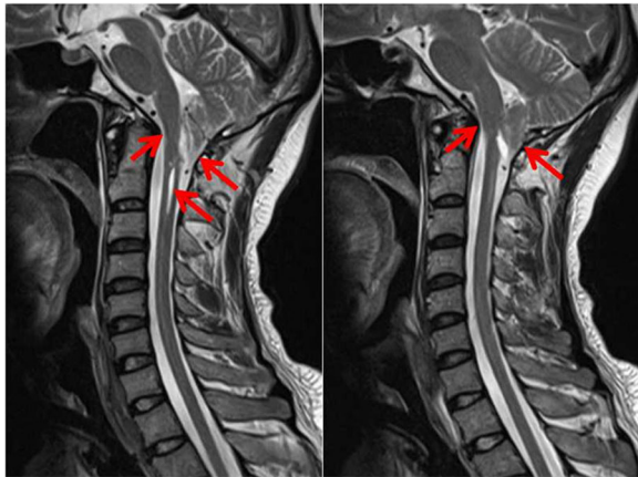
Fig. 2 Magnetic resonance image of the cervical spine. Arrows indicate tonsillar herniation to the first cervical vertebra with a posterior dislocation of the odontoid process and syringomyelia. The medulla and high cervical cord are compressed and deformed

months of follow-up. Although his cough and expectoration abilities were good, significant changes in his neurological symptoms and signs were apparent when compared with his status before pneumonia. For example, the patient occasionally experienced dizziness and visual rotation with postural changes and could not perform fine movements of the right hand, such as clapping and writing. Additionally, he continued to experience weak muscle strength in the right limbs (grade 4), numbness in the right upper limbs, and a reduced sensation of pain and temperature below the right wrist. The patient refused further surgical treatment for the Arnold–Chiari malformation and posterior dislocation of the odontoid process.