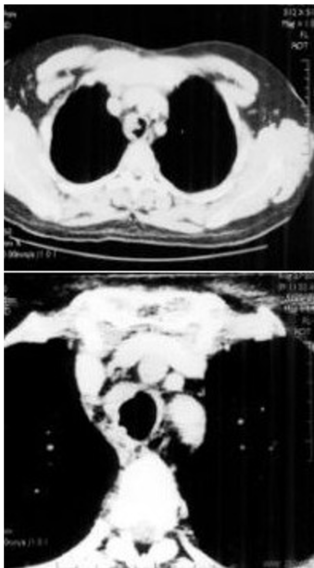
Figure 2 a) Chest CT scan displays a polypoid mass occupying 50 % of the lumen. b) Control CT scan displays resolution of the tumor

The patient underwent adjuvant radiation therapy after the operation. CT scan of the neck revealed resolution of the tumor (Figure 2b). Now, 3 months after the operation, the patient has remained well.